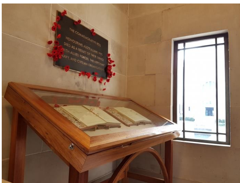
Commemorative Roll