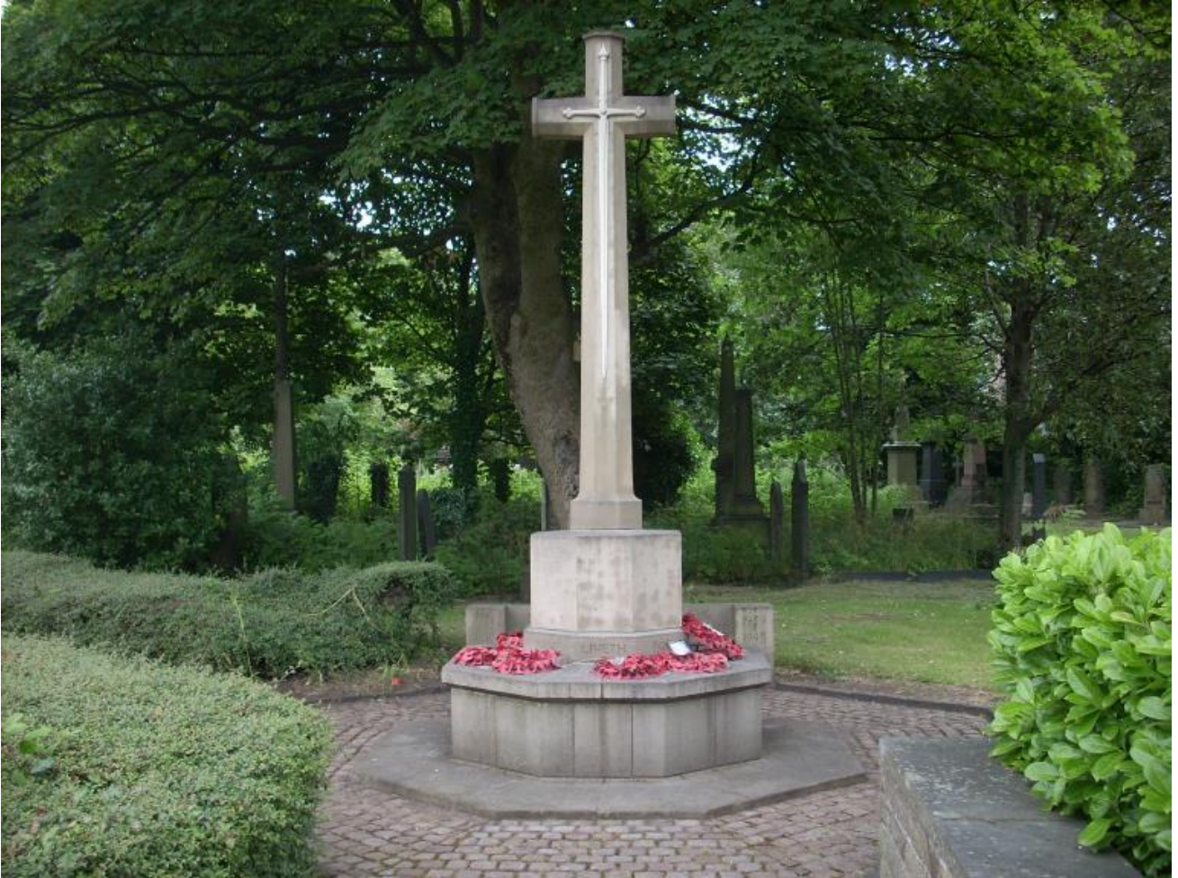
Cross of Sacrifice – Undercliffe Cemetery