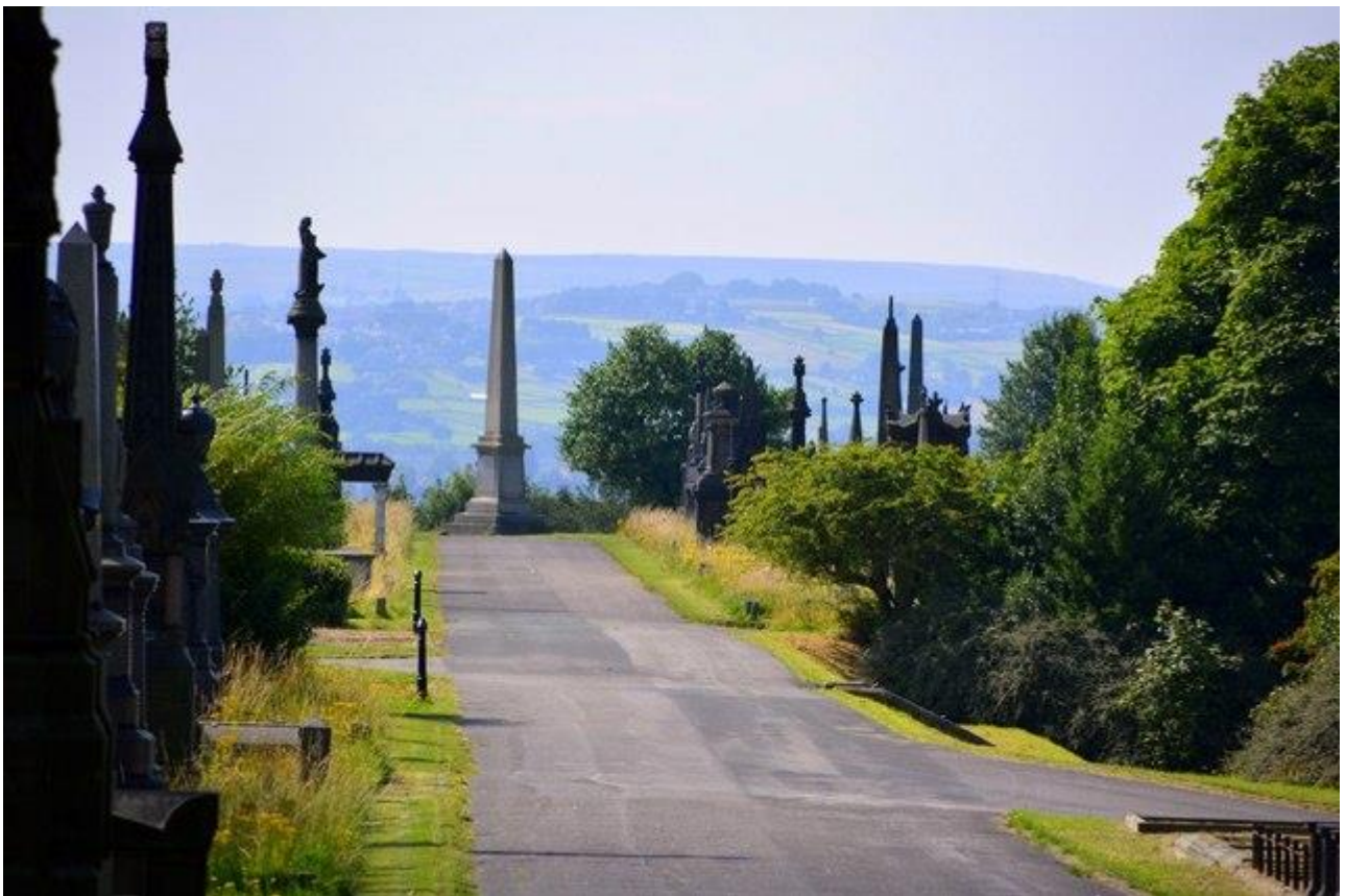
Undercliffe Cemetery