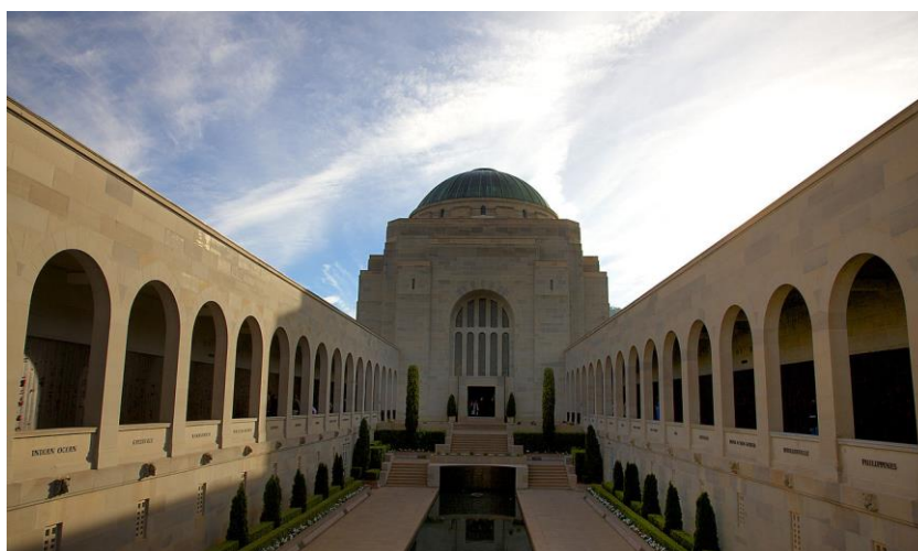
Commemorative Area of the Australian War Memorial